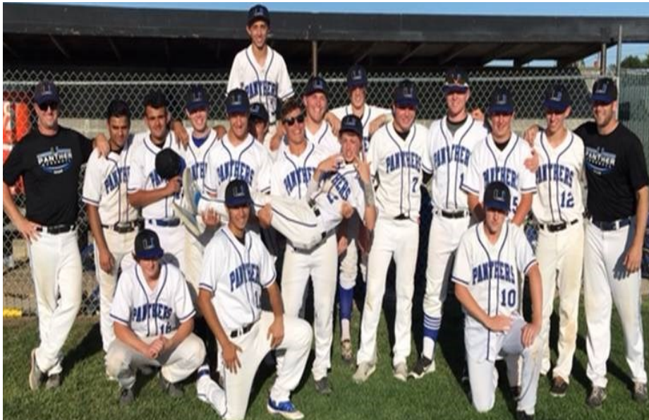
The varsity boys baseball team pose after their 4-3 playoff victory against Corning. The win marks the first playoff victory in the U-Prep program's history.