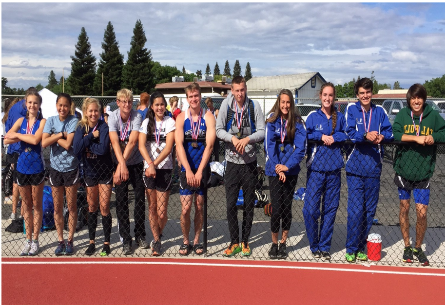
All-league winners from the MTL Track Championships!